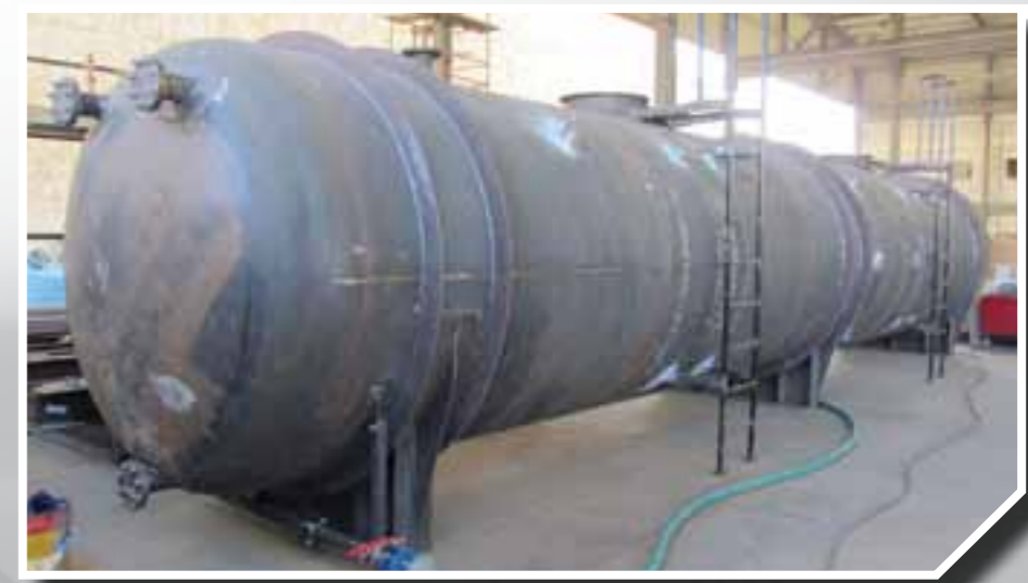
FABRICATION OF 50M3 TANK CLIENT: BAUER NIMR

TANKS Specialized In Engineering, Procurement, Fabrication, and Erection of Multipurpose Tanks In Water, Oil & Gas Sectors. Types Of Tanks Include: Vertical Storage Tanks HDPE Tanks GRP TANKS SS TANKS Sewage Water Tanks