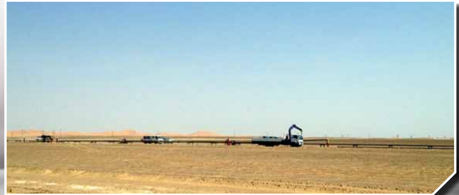
FLOW LINE CONSTRUCTION CLIENT: ATILA DOGAN (PDO)