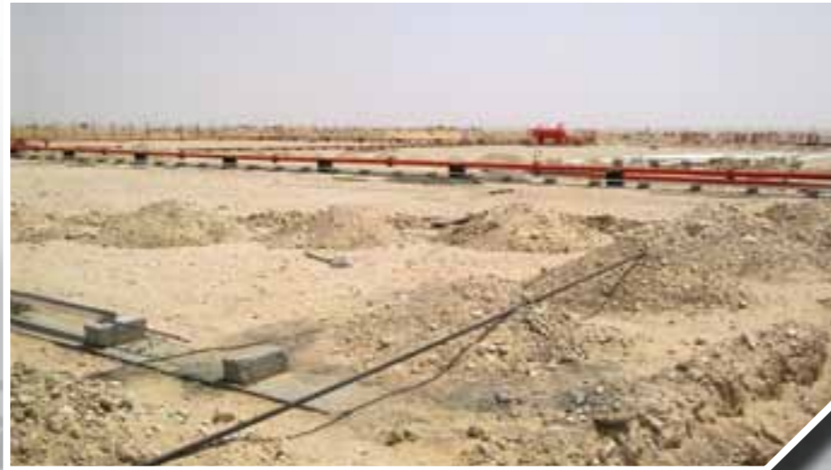
PIPELINE CONSTRUCTION FOR EPF - MUNHAMIR II CLIENT: PTTEP

Successfully installed multiple sizes of Pipelines and Flow lines in Oil and Gas sector.