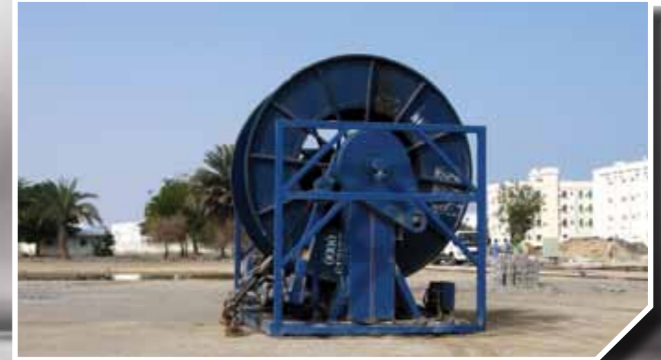
COILED TUBING FABRICATION CLIENT: OCCIDENTAL OF OMAN

Fabricated, delivered and installed coiled tubing.