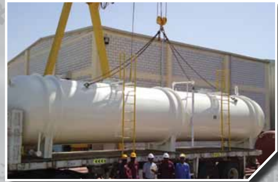
MOUNTED ON FLATBED TRAILER