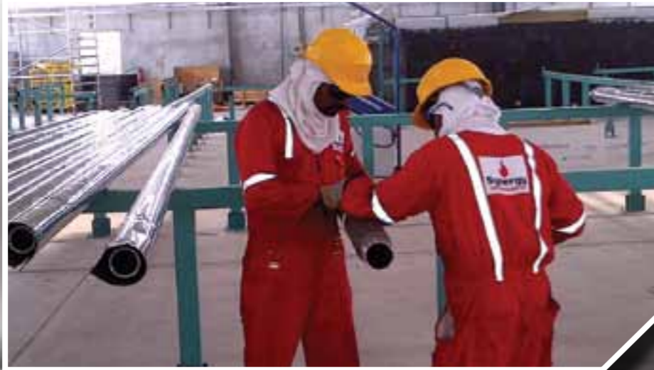
VACUUM INSULATED PIPES CLIENT: OCCIDENTAL OF OMAN

Locally fabricated vacuum insulated tubing utilized for the transport of steam, hot water and hot oil. The tubings are of highest quality and insulating capabilities.