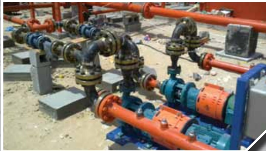
INSTALLING PIPE SPOOLS AND PUMPS CLIENT: AL MANSOORI